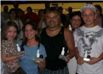
Top Bowling Team- Sugar Cubes