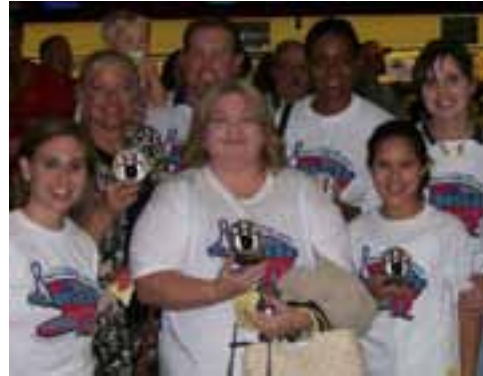
Top Fundraising Team- Strike Force Medco